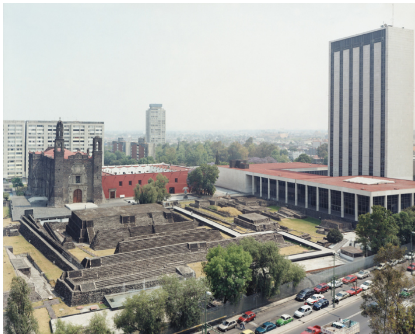
Tlatelolco, Mexico City, 2004